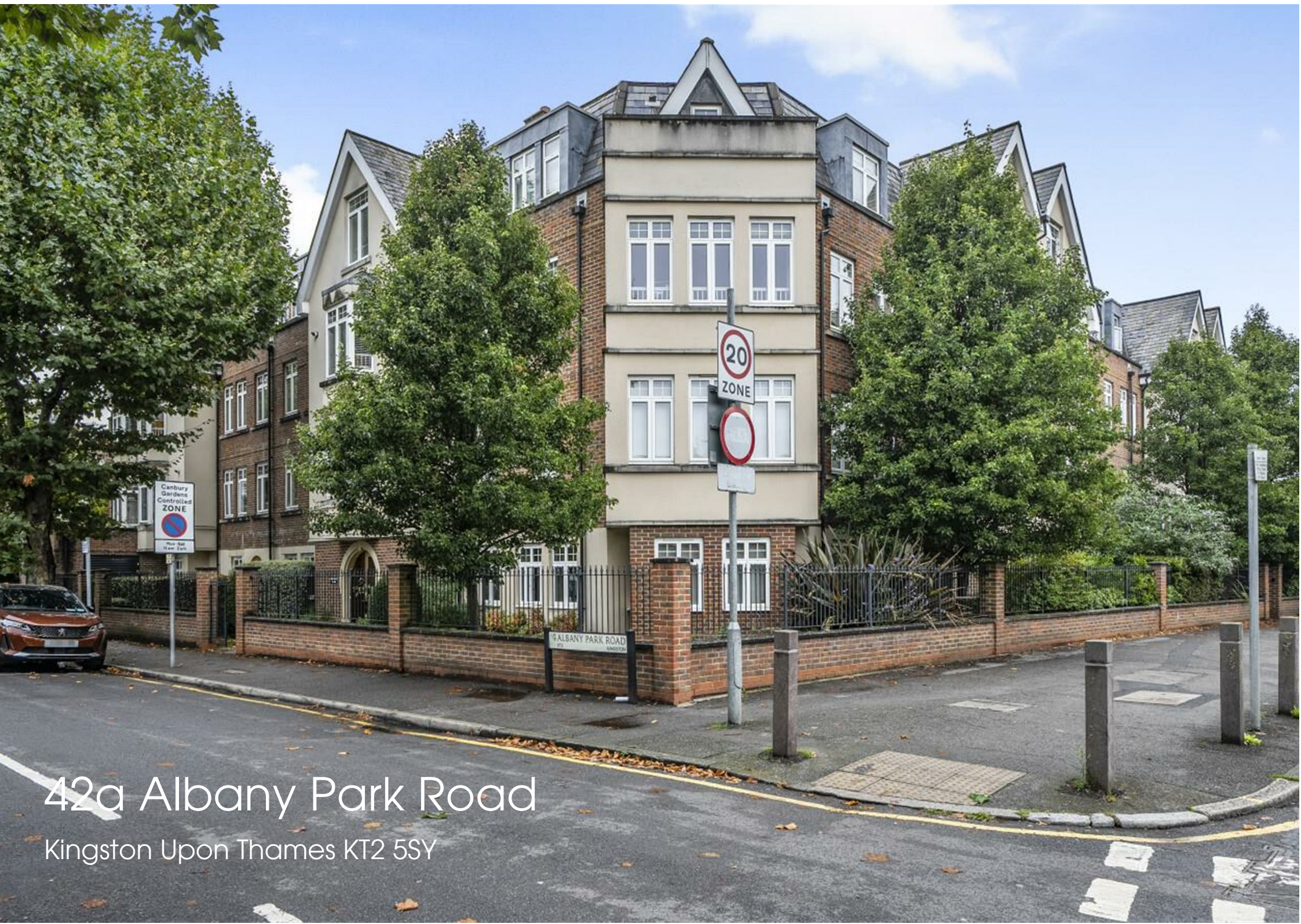
42a Albany Park Road Kingston Upon Thames KT2 5SY